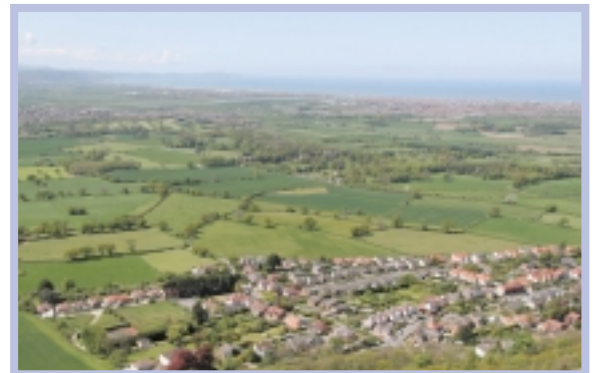
View from Moel Hiraddug.

Turn left at main road and walk through village until you reach the Cross Keys pub on left. Immediately opposite is a footpath leading towards the falls. Follow this path until you see some stone steps on the left which will lead you down to the main road near tea shop. Turn right at tea shop and back to car park.