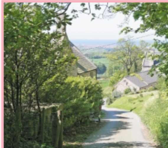
View from above Pentre Cwm.

At the next crossroads turn right. Continue down the road, past the old farm of Tan Llan and to the crossroads where you turn right. The lane is a little wider here but can attract more traffic coming from the A55. The road continues back to Dyserth parallel with Moel Hiraddug on your right.