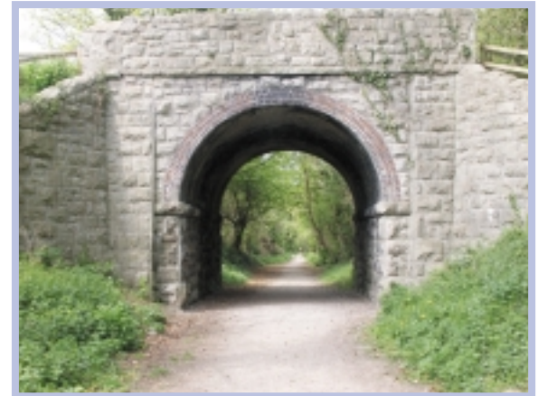
Stone bridge over Dyserth-Prestatyn Walkway.

gate immediately opposite, entering an open field managed by the Wildlife Trust. Head across field diagonally to the right towards gate and stile.